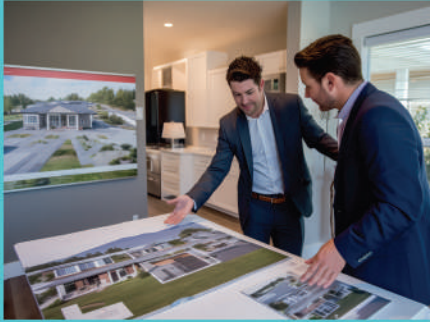
Immersive Case Studies

This cutting-edge program combines academic rigor with real-world application , fostering innovators who will create sustainable, resilient , and thriving urban ecosystems .