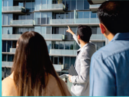
Real-World Project-Based Learning