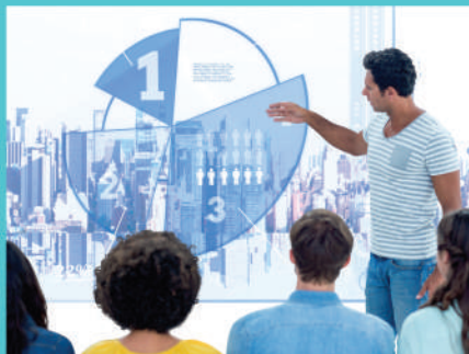
Simulation Based Learning